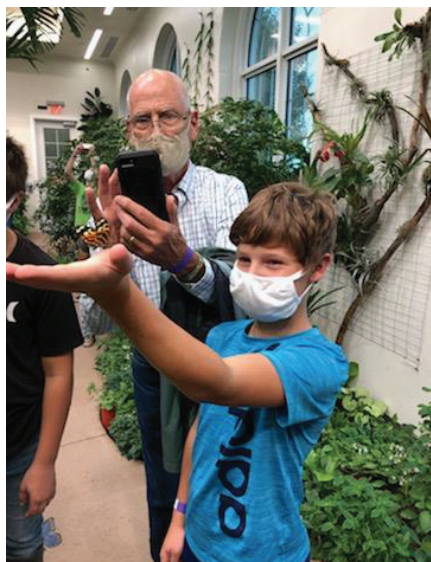
A visit to the Hershey Butterfly House on a cloudy afternoon!